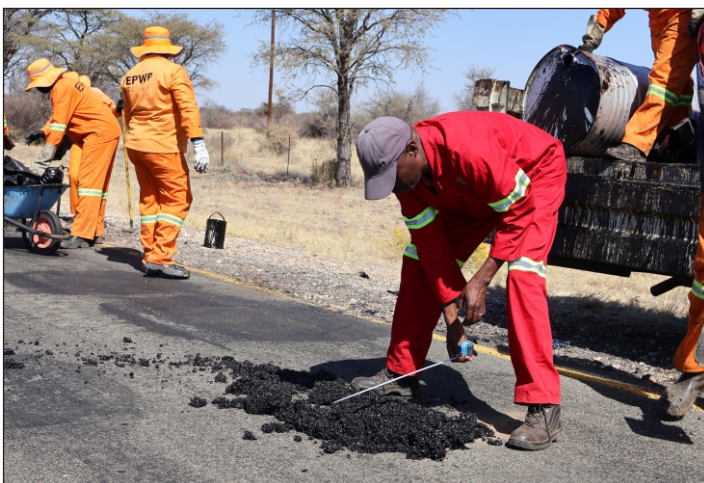
Our road maintenance team hard at work on the road between Tlaskgameng and Ganyesa in the Dr Ruth Segomotsi Mompoti District.